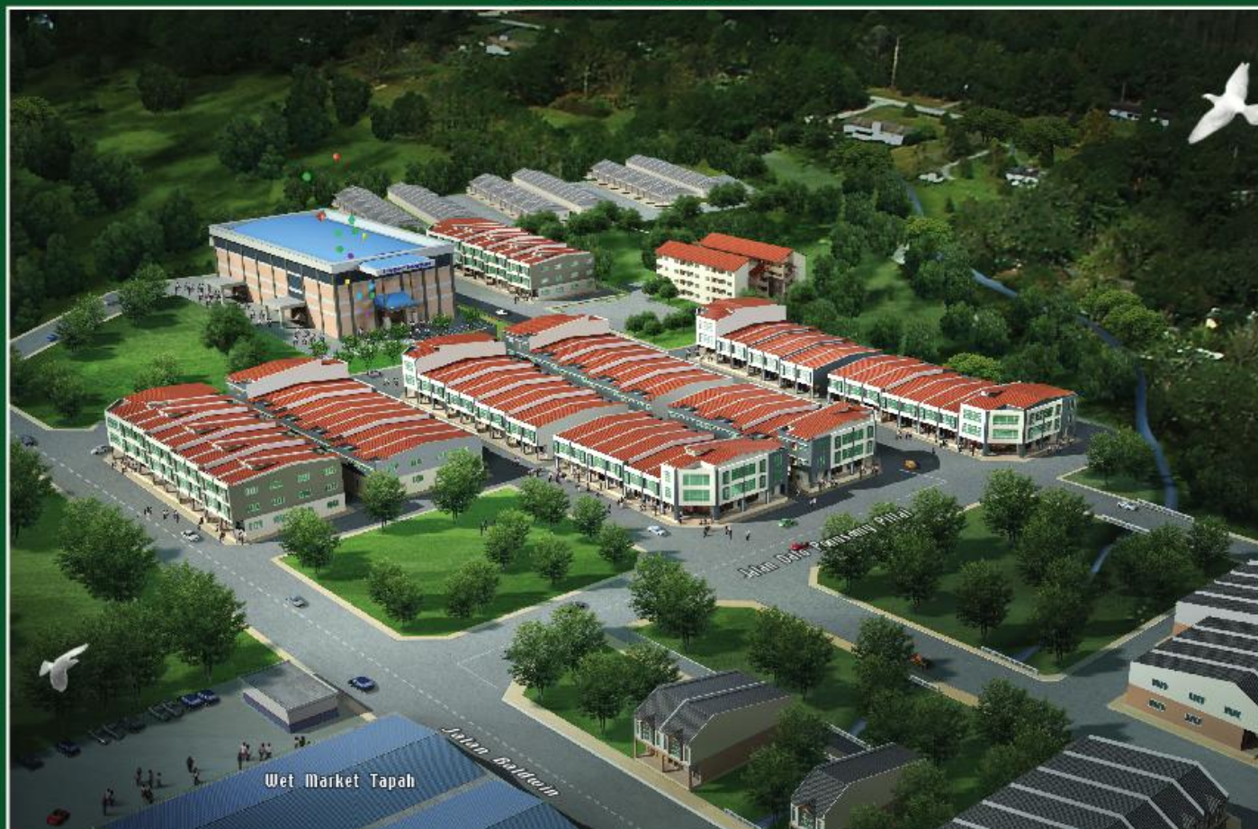
Aerial View Bukit Baldwin Business Centre